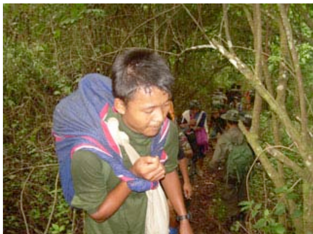
The photo, taken on August 2 nd 2009, shows displaced villagers in Papun District as they carry food supplies obtained from an aid group near the Thai-Burma border.

Concentrated attacks by joint Burma Army and Democratic Karen Buddhist Army (DKBA) forces on Karen National Liberation Army (KNLA) 5 th Brigade in Papun District have been predicted since KNLA 7 th Brigade lost control of three camps in Pa'an during June 2009. 1 To date, KHRG researchers have not reported a significant increase in armed conflict. They have, however, reported increased military activity in the government-controlled areas of southern Papun. These activities include increased army patrols, planting of landmines in civilian areas, forced labour, restrictions on travel and trade, arbitrary violence and summary executions.