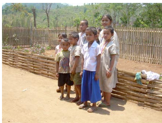
This photo, taken on April 5 th 2009, shows children from L--- village tract, Lu Thaw Township. They are now longer able to attend school because their families are struggling to find food.