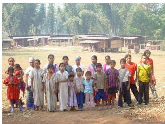
This photo, taken on March 28 th 2009, shows children from the N--- village tract, Lu Thaw Township. These children no longer have parents, and could not attend school without outside support from groups based in Thailand.

In spite of resource shortages, IDPs in Lu Thaw have been able to operate some schools, though on limited schedules and not for full school years. In some cases, schools have been temporary bamboo shelters or natural clearings near forest hiding sites. Cross-border support from groups in Thailand has enabled some schools to operate more effectively, even in cases where families are unable to continue supporting their children. In N--- village tract, Lu Thaw Township, for instance, the Thaw Khee Der school is able to provide education for 39 students whose families can no longer feed them. Of the total, 11 are under 9 years old, 15 are between 10 and 14 years old and 13 are between 15 and 18. In other places, such as Kay Bpoo village tract, fewer families are sending their children to school than in 2008. These families say they must rely on their children to help look for food in the forest.