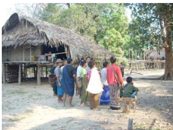
This photo, taken on April 19 th 2009, shows villagers from M--- village as they prepare to carry thatch shingles for SPDC soldiers based at M--- army camp.

Elsewhere, villagers are required to pay porter fees rather than provide labourers to carry goods. In Gkyoh Klee Loh village area, DKBA Gk'saw Wah Special Battalion #777 Deputy Commander Saw Hser Htih has been demanding porter fees since November 2008. Large villages must pay 15,000 kyat (US $14.08). Villages with fewer households must pay 8,500 kyat (US $8).