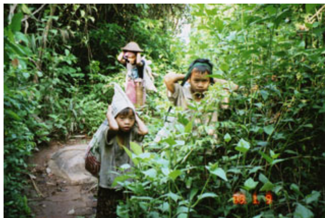
Children from Ler Wah and Kwih Lah fleeing into the forest with whatever they can carry as SPDC troops attack their villages on May 10 th 2006. Disregard incorrect date printed in the photo.

Along the Shwegyin river at the boundary of Shwegyin and Kyauk Kyi townships, SPDC troops had already occupied the area twice in 2005, causing the villagers to flee eastward into the hills. Each time the troops withdrew after two to six weeks and the villagers were able to return home (see Nyaunglebin district: SPDC operations