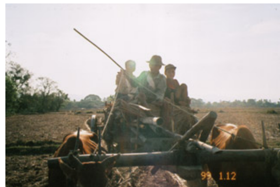
Villagers transport personal belonging to Plaw Law Bler relocation site in late April 2006. Disregard incorrect date printed in the photo. [Photo 2006]