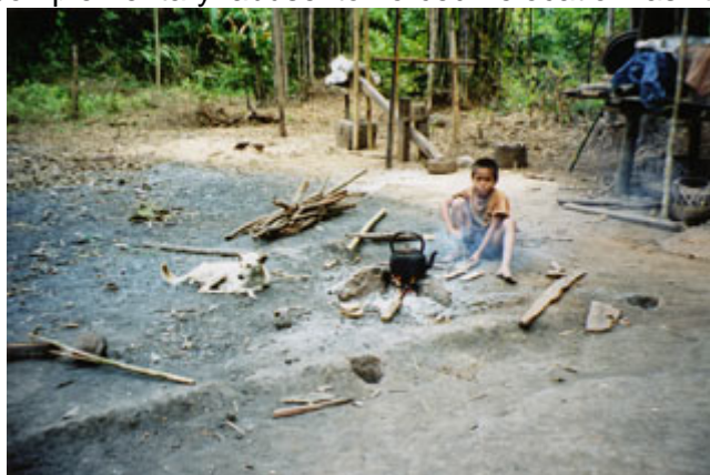
Naw G---, a young girl in T--- village, Mone Township cooks amid the ruins of her house, burned in late November 2005 by LIB #599.

In Mone Township forced relocation of Karen civilians from the hills continued unabated. On April 8 th , SPDC troops from LIB #562 and #567 and IB #440 under the control of MOC #16 entered Yu Loh and Ka Mu Loh villages in southern Tantabin Township, Toungoo District just north of Mone Township. The troops forced the inhabitants of both villages to relocate to Play Hsa Loh village, Mone Township. The livelihood of the villagers, who were dependent on their betel nut and durian plantations,