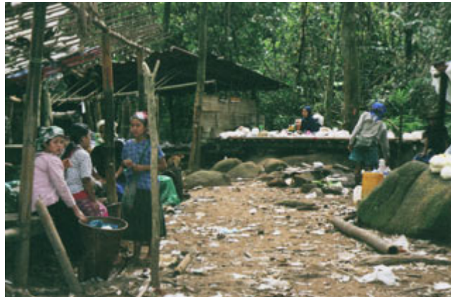
Hill villagers and plains villagers defy the SPDC blockade on the movement of goods by trading at a covert market in the jungle in December 2005.

Villagers have therefore organised systems of monitoring SPDC movements and providing advanced warnings of military encroachment in order to evade SPDC patrols. Intelligence is obtained from local KNLA units, and some villagers who have access to radio equipment have managed to communicate and share information with other villagers regarding the deployment of SPDC forces. Some even obtain landmines from KNLA units for use in defending their hiding sites if necessary. Impromptu schools, churches, and temples are set up even while on the move in the forest to maintain a sense of community and continuity. Despite the SPDC blockades of trade links with plains villages, covert supply lines are established to maintain communications and the flow of necessary goods between plains and hill villages. Community networks through which villagers can exchange food and information have further strengthened their capacity to manage the systematic attacks and abuses committed against them.