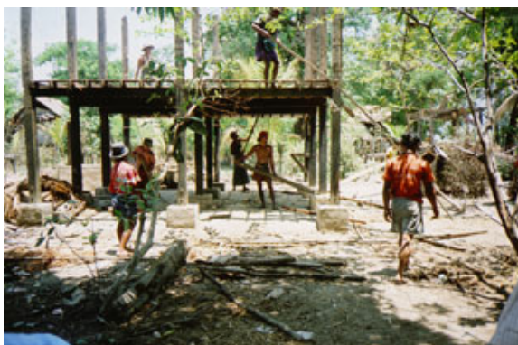
Villagers dismantle their homes prior to moving to Plaw Law Bler relocation site in late April 2006.

– Naw M--- (female, 39), T--- village, Pa Ta Na village tract, Kyauk Kyi Township (April 2006)