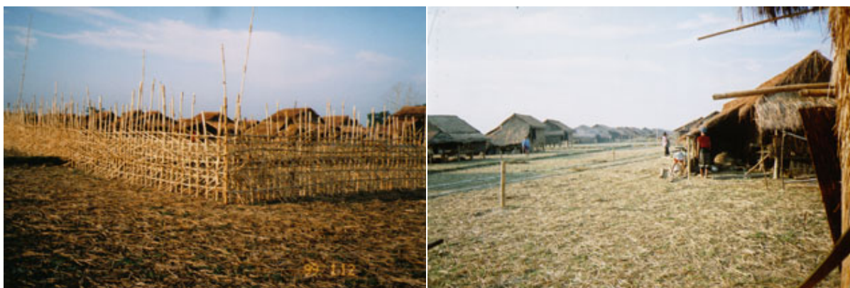
Plaw Law Bler relocation site with surrounding fence, April 2006. Disregard incorrect date printed in the photo.

At Plaw Law Bler relocation site, the military allowed each family a square plot of only ten armspans (15 m / 50 feet) per side on which to construct their new homes, with no space allotted for gardens or livestock. No building materials are provided; villagers were expected to bring their own by stripping their houses in the village, but those without carts for transport could not bring these and have had to build their new houses from grass and rice straw. If the newly constructed house did not meet SPDC specifications, soldiers beat the villagers and ordered them to destroy the building and begin again. Villagers were ordered to construct a fence around the entire relocation site as well as around each individual property. Some villagers with large families stated that the space provided was not large enough for them and those who reared domestic animals were unable to keep them as no other land was provided. Livestock that the villagers did keep was under constant threat of theft from local civilian thieves and SPDC soldiers. Villagers were unable to keep livestock at their old villages as the SPDC threatened that if they left the relocation site without permission they would be accused of having connections with the Karen National Union (KNU).