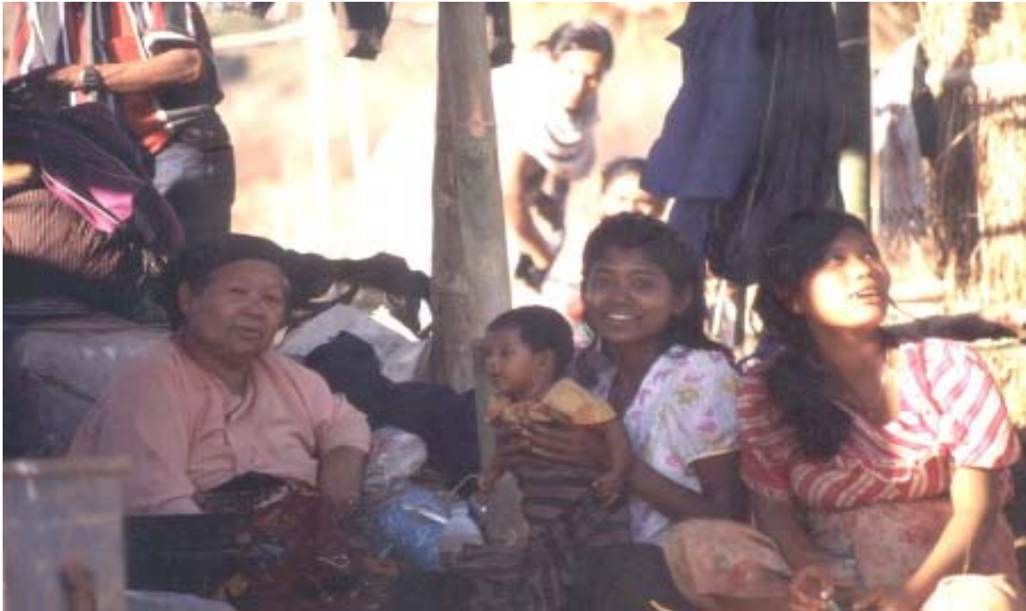
Muslim women in a temporary shelter they built after fleeing from SLORC troops in Doolaya District in 1997.

“Living in our place is the best, even with whatever pressure they put on us. Here [in Thailand] is the same. We don’t have work permits so it is difficult for us to work. Some of the bosses don’t dare to call us if we don’t have work permits. They only make work permits for the old people [people who have been in Thailand for a while] in Thailand. They don’t make them for the new people either.” - “Khin Kyaw Mya” (M, 28), Muslim villager from xxxx town, Rangoon Division (Interview #3, 2/02)