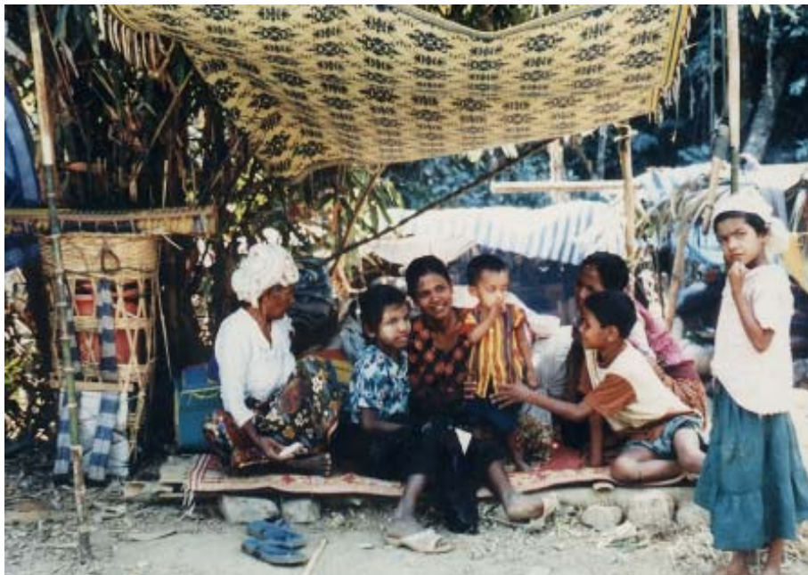
Muslim villagers who fled to Thailand following the SLORC's 1997 Offensive in Dooplaya District.

spiralling inflation, food shortages, and the lack of progress in the SPDC's talks with Daw Aung San Suu Kyi. They took place in various cities at different times from February until October 2001; first in Sittwe town of Rakhine State in early February, then Toungoo (Pegu Division) in March and again on May 15-17, Kyaukpyu (Rakhine State) on May 14 th , then Prome (also known as Pyi, in Pegu Division), Pakokku (Magwe Division), Pegu (Pegu Division), Henzada (Irrawaddy Division) and other towns throughout October. There were also reports of orchestrated anti-Muslim violence in Tantabin, Zayat Gyi, Oak Twin, Pyu, Yedashi, Sein Ywa, and Kyauk T'Ga (all near the Nyaunglebin-