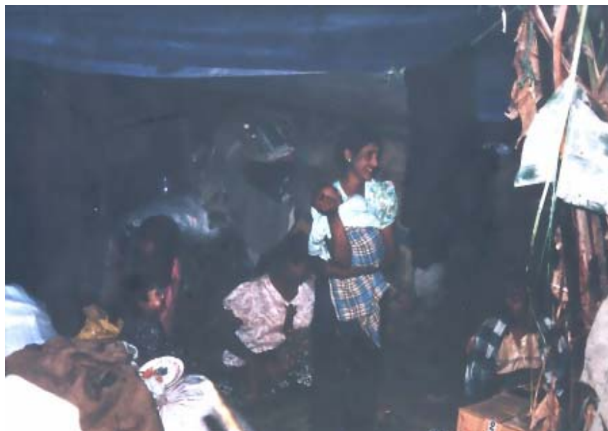
Muslim villagers from Dooplaya District who fled their homes during the SLORC’s 1997 Offensive.

“An unknown writer issued many books to block the development of the religion of Islam. The book contains writings on ‘Sa Ti Kya Thakin Ma’ [‘The Master’s Daughter’s Servant’; an attempt to link the Muslims with Aung San Suu Kyi since she is the daughter of a Thakin, as her father, Aung San, was known], how the people from India arrived in Burma [referring to their arriving